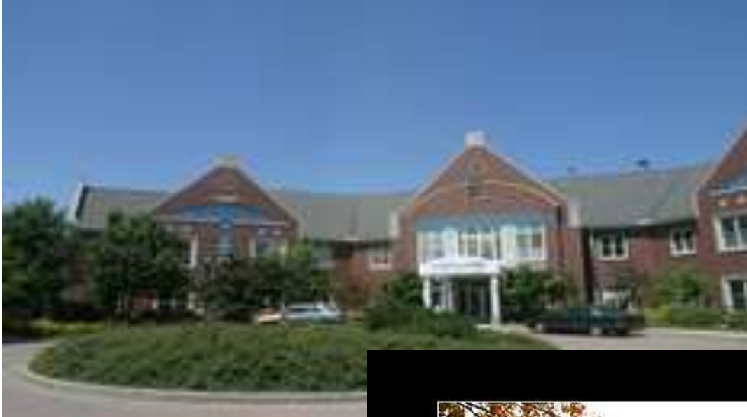
Ronald McDonald House of Cleveland 37 rooms