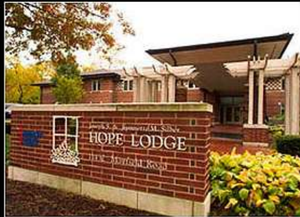
Hope Lodge, Cleveland 31 rooms