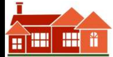
Transplant House of Cleveland